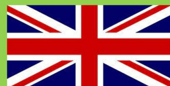
Mutual respect and tolerance