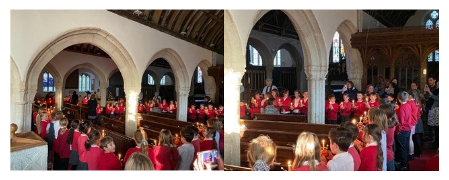
CHRISTINGLE CELEBRATIONS FROM LAST FRIDAY