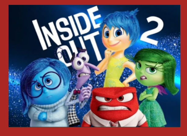
Your paragraph text

FOSS have generously covered the cost of transport to this event - they are able to do that because of their dedicated volunteers and everyone who attends their events!! THANK-YOU FOSS