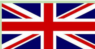
Rule of Law